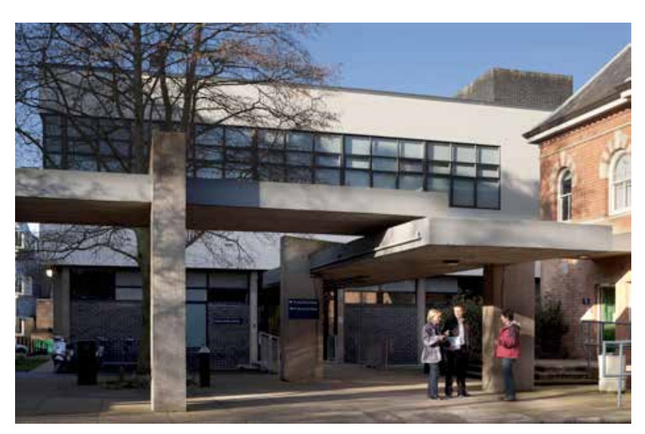
Figure 2: The University of Leicester School of Museum Studies in 2009