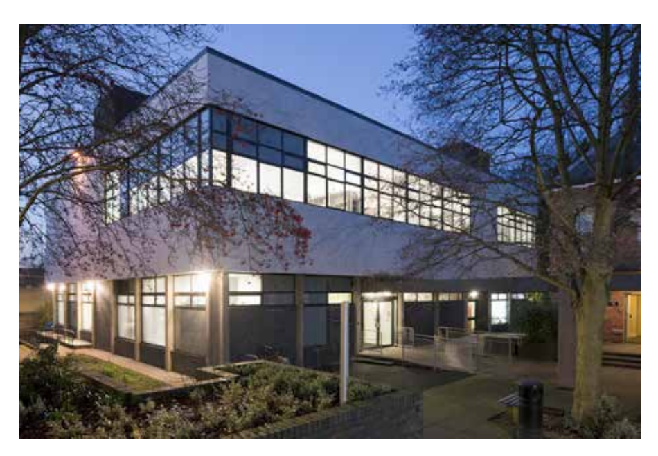
Figure 3: The University of Leicester School of Museum Studies in 2009.

a module on museum buildings and equipment. This section included information on furnishing, cleaning, lighting, and heating museums as well as information on museum security and insurance. The fourth module of the course emphasized collections and exhibitions including collections policies, using and displaying objects, and arranging, preserving, conserving, restoring, and repairing objects. The fifth of the taught modules, titled "Museum Activities", focused on dealing with the public, including how to handle enquiries, cooperating with local authorities and other institutions, temporary exhibitions, sales of museum publications, photographs, and reproductions as well as lectures, films, concerts, and other public functions. The final mandatory activity for all students included practical work both in and outside the department which the course guide described as "relating to display techniques, storage, lighting, modelling, casting, etc., in addition to periods of attachment to national and provincial museums in the United