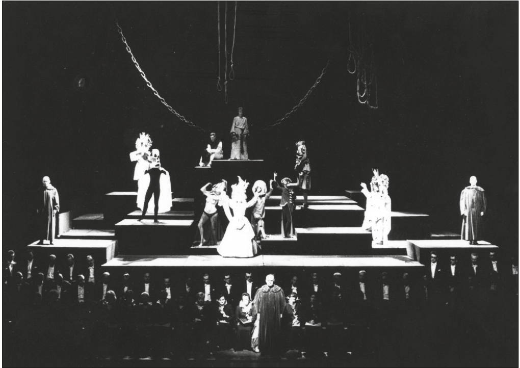
Fig. 2: A. Honegger: Jeanne d'Arc au bûcher . National Theatre in Brno, 1969. IV. scene: 'Joan Given Up to the Beasts'. Archive NTB.

open and more program-like in Brno. The line of political theatre did not come about without a link to Soviet theatre avant-garde or Rolland's People's Theatre. 11 The struggles with the censorship bodies were demanding and only certain pieces were successfully pushed through out of the planned titles. Opera, due to its highly stylized form which can soften any kind of political content, did not face such extensive censorship. Of course, the radical modernity of the dramaturgy and the staging method can be viewed as a political issue as by means of provocation it calls into doubt the audience and listening customs of the traditional opera public. A number of operas, however, acted as provocation merely from a thematic perspective. Even without any particular intention, operas such as The Nose , Wozzeck or The Condemnation of Lucullus , as recalled by certain participants, live on as a reference to the social and political atmosphere of the Normalization era. This is the way in which the staging of From the House of the Dead from the year 1974 was, for example, spoken about. It is known that Janáček's original conclusion had a pessimistic sound. After Gorjančikov is released from prison, the guard drives the other prisoners back into their cells. Later changes added an optimistic aspect in the form of the celebration of freedom. The return to Janáček's original