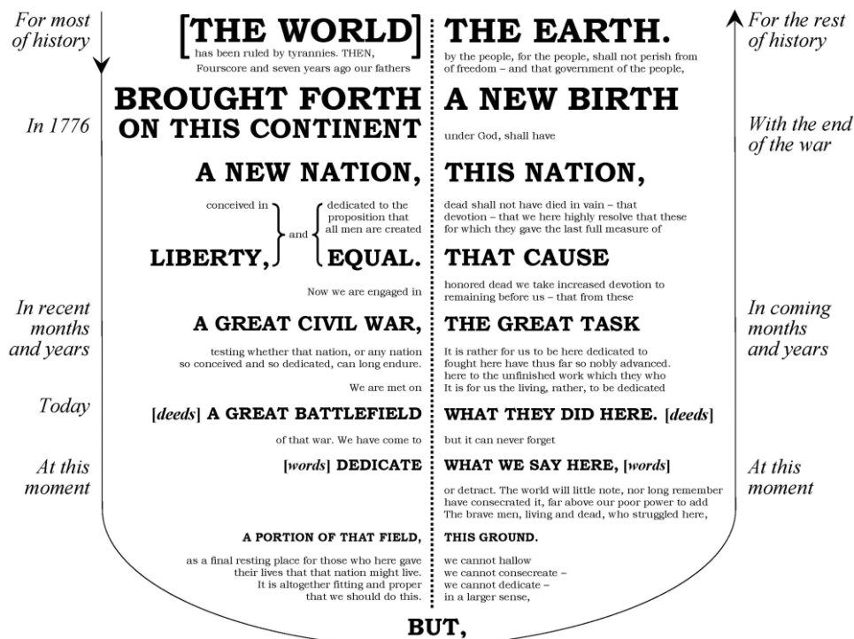
Figure 2. The U-shaped structure of the Gettysburg Address

Implicit in Lincoln’s famous opening is the view that the world at large, presumably for all its previous history, had been under the dominion of governments that were not conceived in liberty or equality – tyrannies, that is, of one sort or another. Then, “Fourscore and seven years ago,” in one part of the world (“on this continent”), something happened that changed the course of that history: a new nation was born, “brought forth,” dedicated to exactly those values. We then jump to the present, “now,” when that nation and its values are undergoing their severest test. That “now” refers generally to the current situation; Lincoln was speaking in the war’s 32 nd month. The next step, however, takes us to a narrower now, the day of