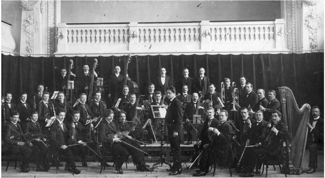
Fig. 1 The young maestro Talich, with the then 37-member orchestra of the Slovenian Philharmonic Orchestra which could be called also the second Czech Philharmonic, since more than half of its members were Czech musicians working in Slovenia.

Such a position against the main sponsor of the majority of Slovene music societies naturally could not have had a favourable impact on the growth and development of Slovene musical culture. It can therefore be said that in the area of pre-war musical culture, the Slovenes were their own worst enemy, since discord, factiousness and mutual opposition were what caused the most damage to musical development and the progress of Slovenia's burgeoning music culture.