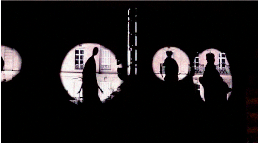
Fig. 3: Copyright ACTLD.com, Strasbourg 2017, Le ballet des Ombres Heureuses , Photo by Eva Šlaisová