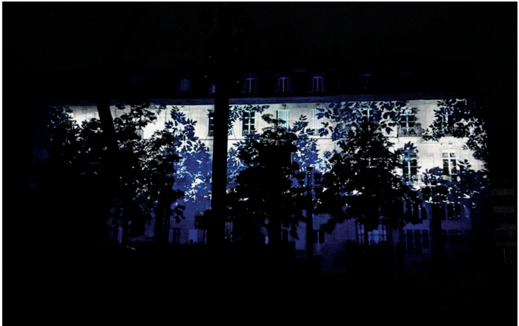
Fig. 2: Copyright ACTLD.com, Strasbourg 2017, Le ballet des Ombres Heureuses , Photo by Didier Boy de La Tour