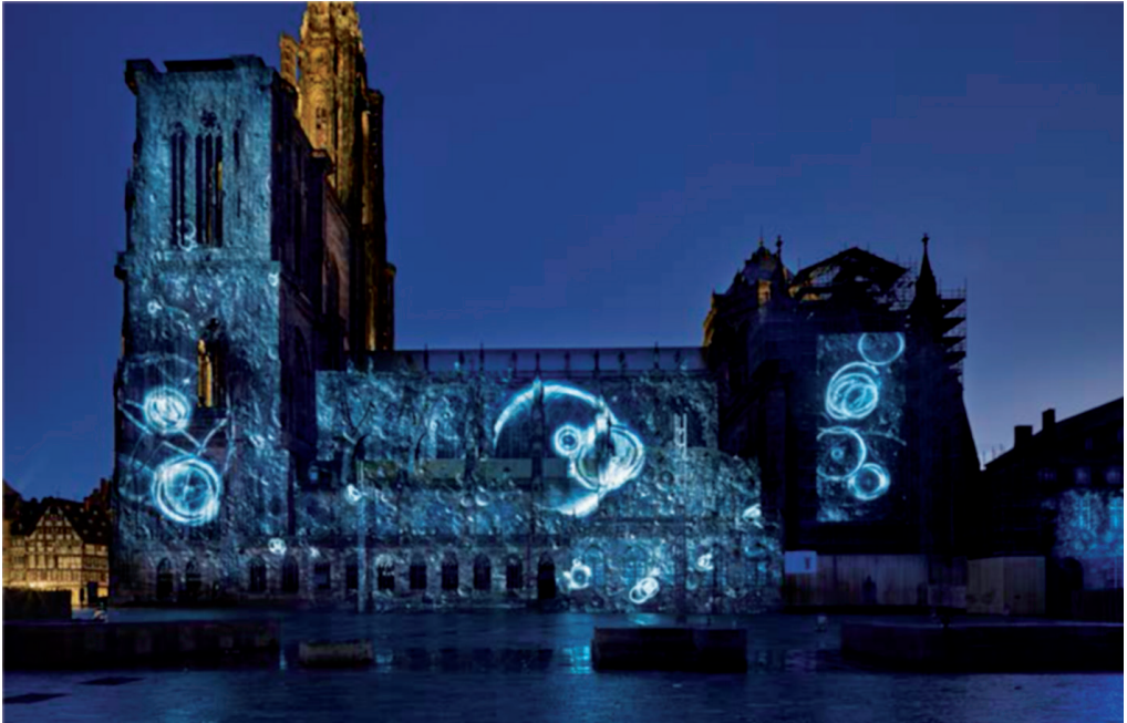
Fig. 1: Strasbourg 2017, Le ballet des Ombres Heureuses