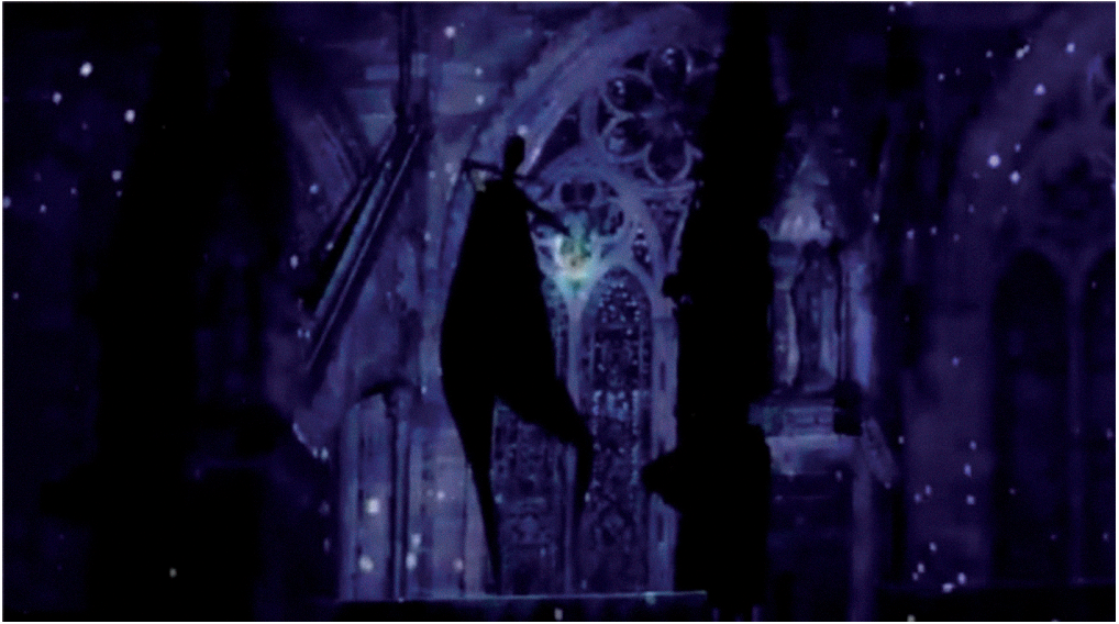
Fig. 5: Copyright ACTLD.com, Strasbourg 2017, Le ballet des Ombres Heureuses , Photo by Eva Šlaisová