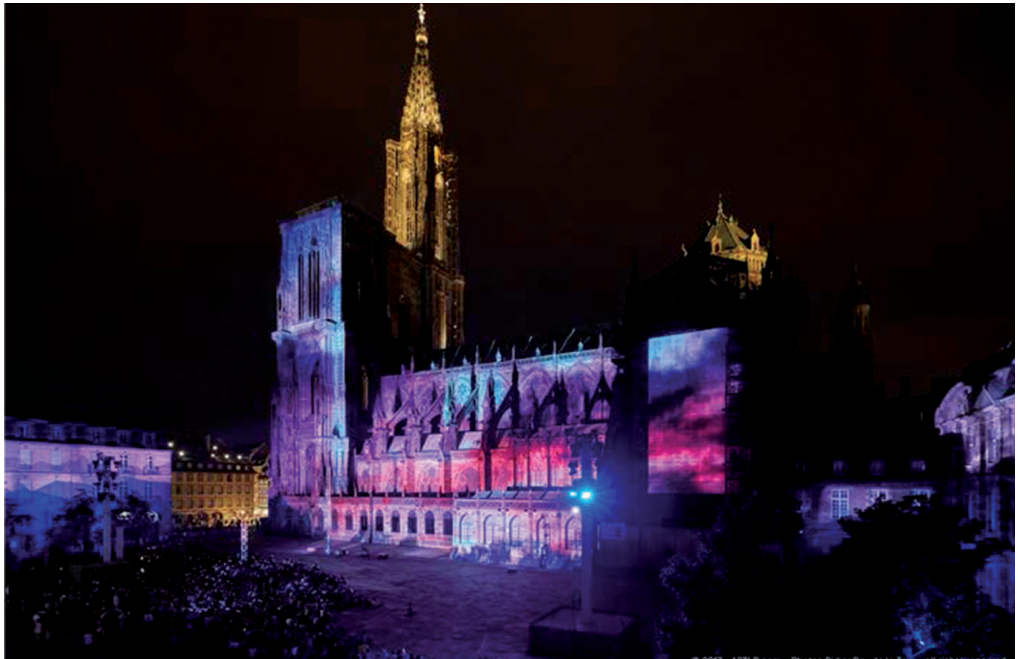
Fig. 6: Copyright ACTLD.com, Strasbourg 2017, Le ballet des Ombres Heureuses , Photo by Didier Boy de La Tour