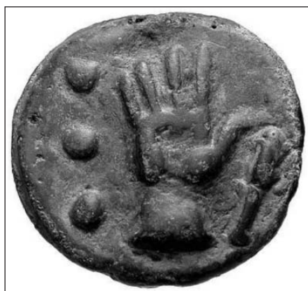
Aes grave with frontal hand

reverse of an aes grave of the mid-third century BC, as an illustration of the manus tendere gesture (37). In Roman art manus denotes the various potencies of the hand to act, to express states of emotion, to convey concepts of possession and power, and to indicate relationships of status (one person of lesser rank than another). 13 In the meeting scene of Anchises and Aeneas the expression palmas tendere aims probably at bringing to the attention of the reader relations of power and social status that the manus symbolized and were part of a traditional value system that was still in fashion in contemporary Rome.