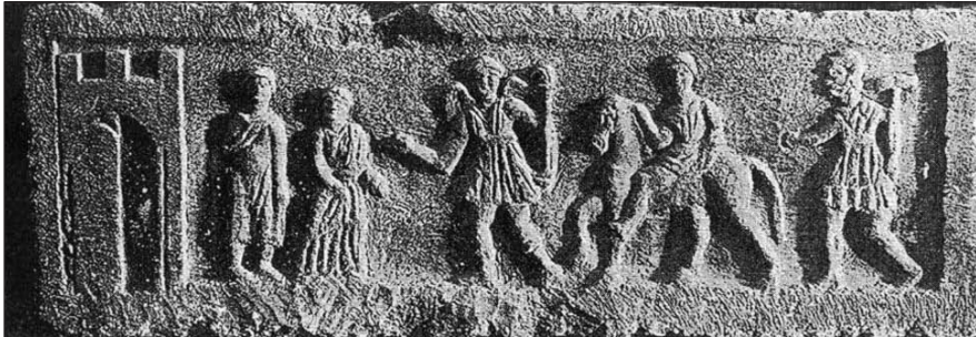
Bruschi sarcophagus. The final stage of the journey to the city of the dead under the direction of Charu(n) and Vanth. 3rd century, Tarquinia, Museo Nazionale

that the scheme was part of the stock-in-trade in Roman popular art which provided illustration for funeral and triumph indifferently (31). The horseman statue on tomb serves to heroicise the dead cavalry man and indicate symbolically his ultimate victorious journey to the afterlife” (Brilliant 54). Haynes suggests that the idea of the journey of the soul to the underworld is Etruscan in origin (29). Starting in the 6th century BC Etruscan sarcophagi show images of the journey of the deceased from the place of burial to the other world, which multiply by the 4th century BC. 38 The dead on horse or on foot travels over land or in a ship. Sometimes the guides that accompany the dead carry swords to defend themselves against menacing beings (64), or the deceased on horse or on foot is accompanied by a guide with sword to clear the road towards the city of the dead from monsters. 39