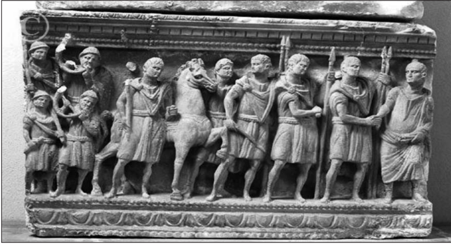
Etruscan urn with military procession, Muzeo Guarnacci, Volterra

Et viridi in campo templum de marmore ponam Propter aquam, tardis ingens ubi flexibus errat Mincius et tenera praetexit harundine ripas. In medio mihi Caesar erit templumque tenebit: