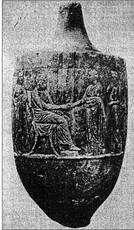
Lekythos relief of Timotheos (Conze, nr.752)

Johansen observes that on white lekythoi there is iconography showing the dead and living together but absence of the motif of dexiosis . 25 The location of the meeting is the tomb in the upper world indicated by the representation usually of a stele (Johansen 59). The scenes on the lekythoi that show dead and living widely separated from one another are meant to suggest that they exist in different states and are unable to make contact. 26 The Houston Painter depicts on a white lekythos two males extending their