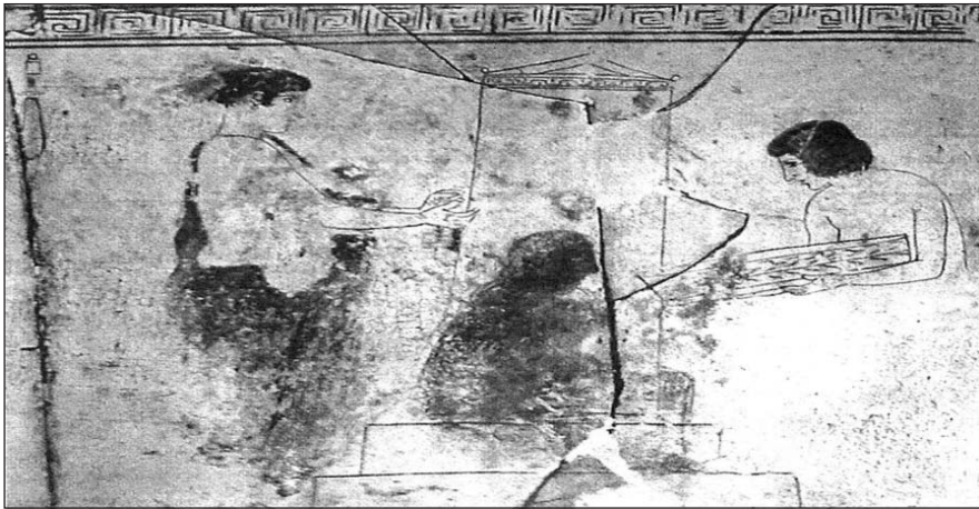
Eidolon (ghost?) of a woman seated on the steps of a tomb attended by two women. Attic white lekythos by the Thanatos Painter (ca.440 BC). National Museum of Athens, 1942.

The Greek passages use the similes σκιῇ εἵκελον ἦ καὶ ὄνειρῳ and ψυχὴ ἢ ὅτε καπνὸς to describe Anticleia and Patroclus as life forms but insubstantial. On the other hand, Ulysses describes Elpenor as εἶδωλον to draw attention to the exterior shape of the dead ( Od. 11.83). 16 We infer that in the Greek source ψυχὴ and εἶδωλον describe the dead as an insubstantial but living presence.