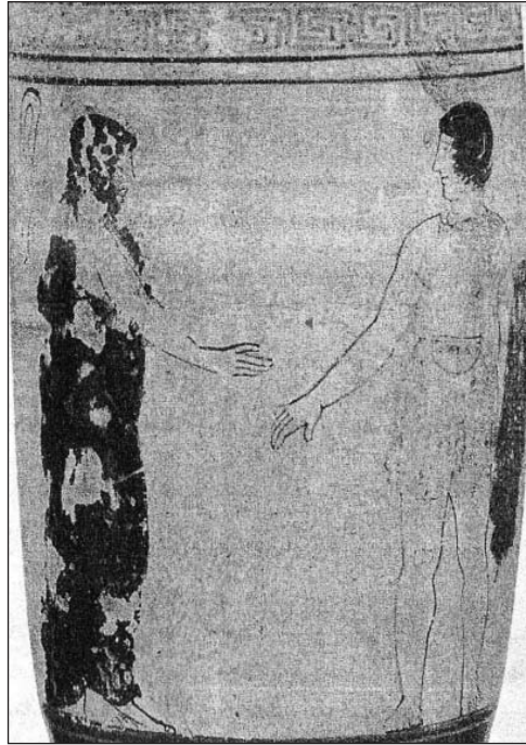
Youth departing. Attic white lekythos by the Houston Painter, ca. 440 BC, Munich, Staatliche Antikensammlungen und Glyptothek ex Schoen 78. (Oakley 71)

hands towards each other in a final farewell gesture at the moment of departure of the dead from the upper world. 27