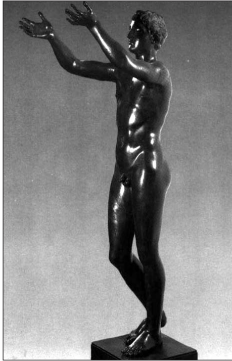
'Adorans' by Boidas, Berlin

funeral reliefs adoring gestures are used to express welcome to a god or the deceased, to indicate social status by marking someone out of the multitude, and to suggest the gesture of offering. 11 Apparently, Virgil describes Anchises' posture in terms of the orans type statues to invest the gesture with ambiguity: a gesture of welcome to a god or to the deceased.