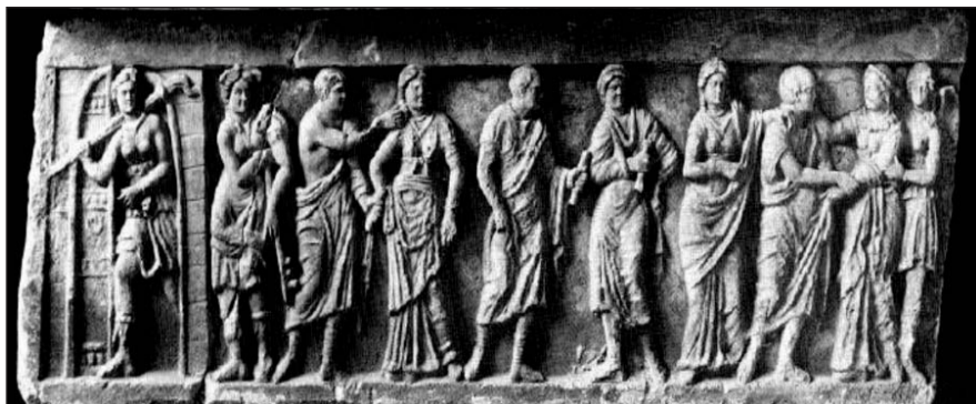
Sarcophagus of Hasti Afunei from Tarquinia, Palermo

Another Volterranean cinerary urn depicts a military procession moving towards right. The movement terminates in the figure of an Etrusco-Roman togate magistrate who receives the respectful honors by iunctio dextrarum from the leader of the procession. 52