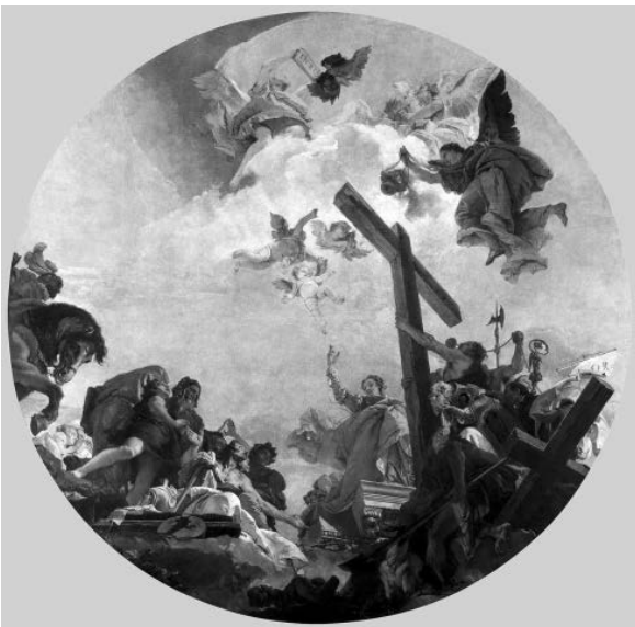
Fig. 2: Giambattista Tiepolo, The Discovery of the True Cross , 1745 ca., Venice, Gallerie dell'Accademia.