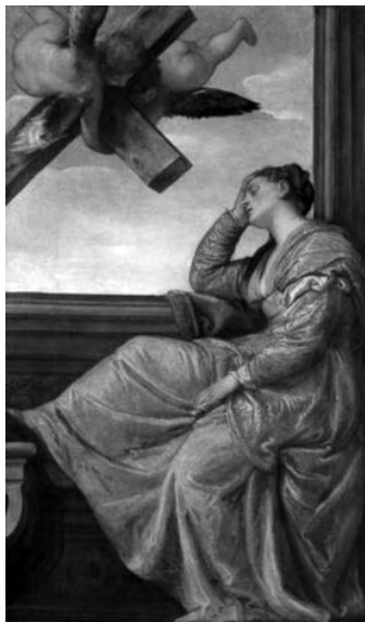
Fig. 1: Paolo Veronese, The Dream of Saint Helena , 1570 ca., London, National Gallery.