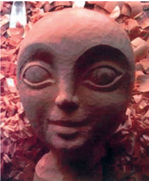
Fig. 7a-c: Photograph of the Marion Lee puppet, showing design with dress frame (a), torso carving (b) and head on a bed of wood shavings (c).