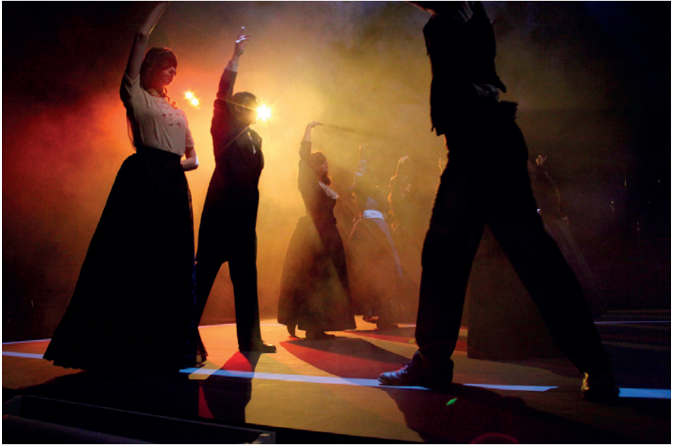
Fig. 9: Photograph from the Ohio State University production of aPOEtheosis showing Poe with and actors dancing during the Masque of the Red Death sequence.