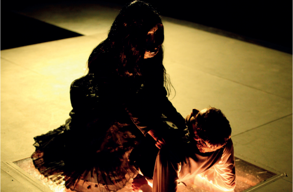
Fig. 6: Production photograph from the Ohio State University production of aPOEtheosis showing Poe tormented by a horrific vision in the 'light box.'

owly figures of anything illuminated by it; the illusion of a bank of seats that mirrored those in the auditorium and which split open to reveal a door to hell/eternity/another world; and, most importantly, a puppet-inflected mannequin of a woman which could be manipulated by actors and deconstructed/reconstructed as needed in the production. The latter object was designed by Petr Matásek and then built by master craftsman Jiří Bareš in his workshop near Hradec Králové. 2 It was shipped to the United States for the production and was then acquired by the Czech Collection at the Theatre Research Institute at Ohio State University after the performances ended. Matásek gave this object the punning name Marion Lee, an acknowledgement of a famous character from Poe (Annabelle Lee) and the stringless 'marionette' influences that it displayed.