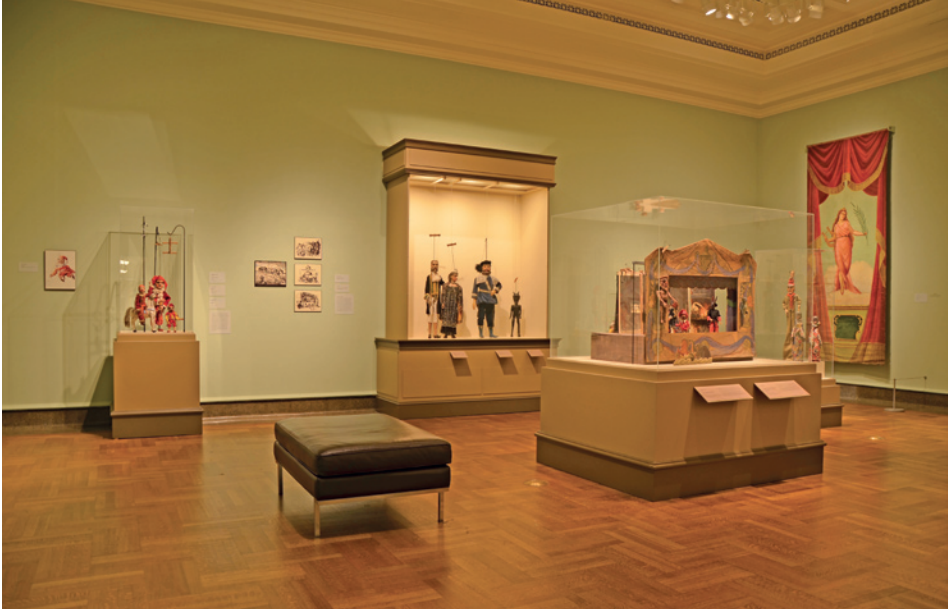
Fig. 4: Aleš's Puppet Theatre, 1913, by František Kysela, collections of Marie and Pavel Jirásek.

Bar and Blackamoors emphasised a fascination with the exotic that is to be understood in a time when foreign travel was infrequent.