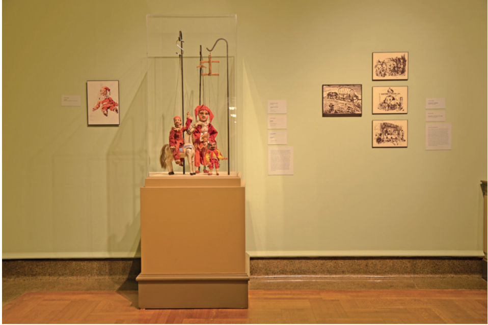
Fig. 2: Two early 20 th -century versions of Kašpárek by Josef Chochol and Josef Adámek, collections of Jiří Vorel, and one 19 th -century version by Jan Flachs, Jr., collections of Marie and Pavel Jirásek.