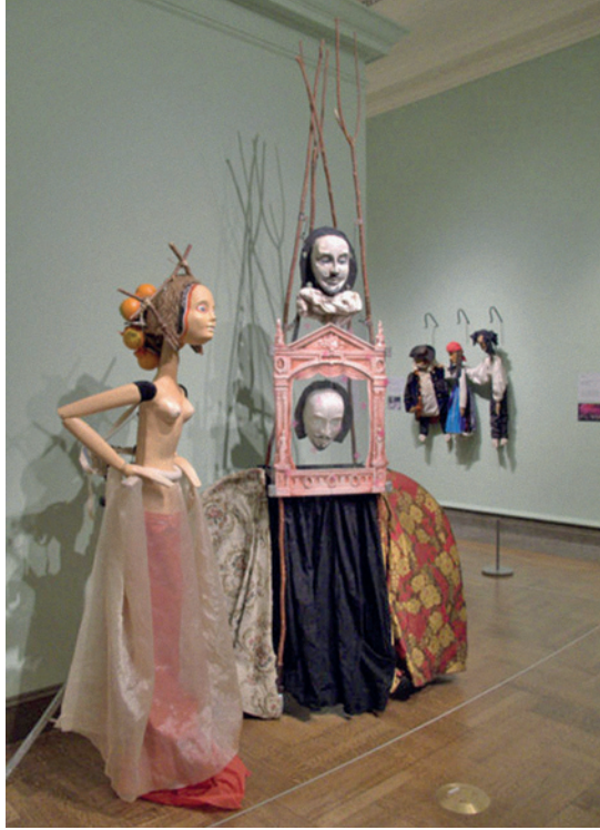
Fig. 1: Installation of figures from Petr Matásek's designs for Miranda and Prospero from The Tempest (2002), collections of the Naïve Theatre, Liberec.