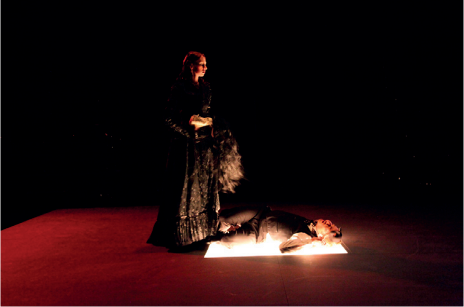
Fig. 8: Photograph from the Ohio State University production of aPOEtheosis showing Poe with with a human femme fatale.

and the Pendulum,' 'The Oblong Box,' and 'The Fall of the House of Usher.' Excerpts from numerous poems ('To Helen,' 'The Bells,' 'The Raven,' 'Annabel Lee,' among many others) concerning Poe's relationships with women – both positive and negative – comprised interludes between the tales. Marion Lee was built to be constructed/deconstructed by actors during the course of the production. She was also exclusively manipulated by the women in the cast. They spoke for her, made her dance, and animated her as a totem of Poe's obsession with a perfect, sublime, but physically unreachable woman. Through the interactions of object and actors, Marion Lee attained the ghostly presence found in many of Poe's works.