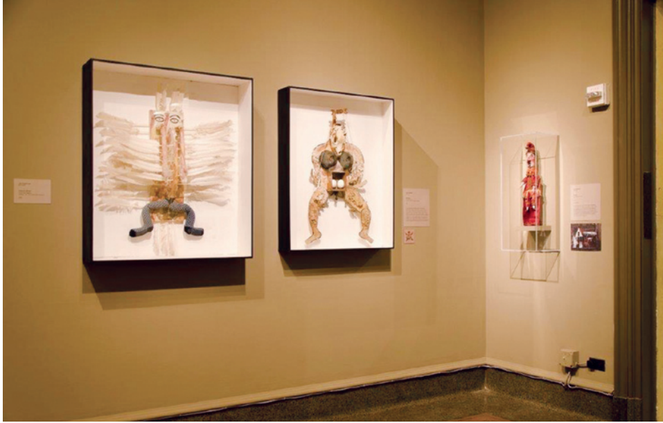
Fig. 5: Androgyn (1990), Icarus' Bride (1990), and Punch (1964) by Jan Švankmajer, collections of Athanor Ltd., film production company.

The 'string' that appeared to interest many younger exhibition patrons was the connection between puppets, and animated and digital films. American filmmakers such as Tim Burton and the Brothers Quay have previously asserted the influence on their work of Czech artists such as Jiří Trnka, Jiří Barta and Jan Švankmajer (all of the latter had items in the exhibit), and many of the films by these three Czech artists have direct relationships to puppetry. After viewing the historical panorama of Czech puppetry, American audiences were given the chance to compare what they had seen in the galleries to scenes from recent live action and digital animation films. Many voiced surprise at the number of connections they could see between the artefacts and the films. All three of Jan Švankmajer's items in the exhibit stretched viewer's notions away from traditional puppet usage, but one forged a link with the past. His stringless Punch, from the stop-action film Punch and Judy (1964), bore an unmistakable relationship to the historical representations of Kašpárek marionettes seen in another room of the exhibit.