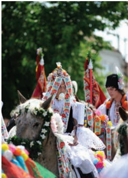
The Ride of the Kings, a traditional festival which is still actively celebrated in four localities in South Moravia (Hluk, Kunovice, Skoronice and Vlčnov), was entered into the UNESCO Representative List of Intangible Cultural Heritage of Humanity on 27 November, 2011.

The teaching staff and collaborators (visiting lecturers, postgraduate students), mainly