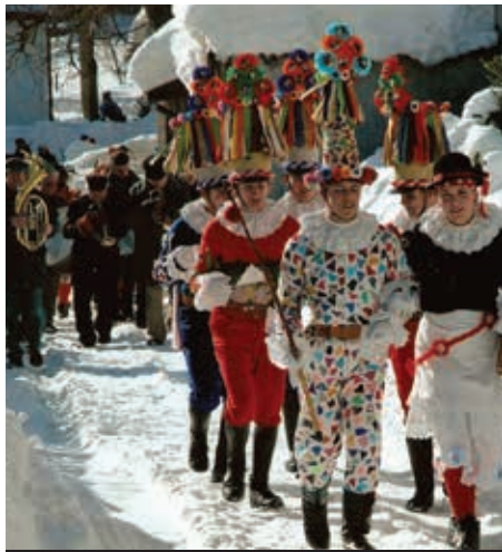
The rural Shrovetide door-to-door processions and masks in the region around Hlinsko were entered into the UNESCO Representative List of Intangible Cultural Heritage of Humanity on 16 November, 2010.

During its whole existence, the Department of European Ethnology has formed the rising generations of ethnologists, so that they are equipped with sufficient theoretical and practical knowledge applicable in various types of professional institutions. This is i.a. also evidenced by frequent employment of graduates in central as well as regional museums and other memory institutions, departments of the Czech Academy of Sciences or the National Institute of Folk Culture in Strážnice. The ability to use the knowledge acquired by professional training in the field of applied ethnology at the university was also proved by an active involvement of graduates from the Department of European Ethnology, Faculty of Arts, Masaryk University, in the preparation of all hitherto elaborated nominations for registration of a phenomenon in the Representative List of Intangible Cultural Heritage of Humanity 26 as well as some proposals for entry into the List of Intangible Objects of Czech Traditional Culture and Folklore. 27