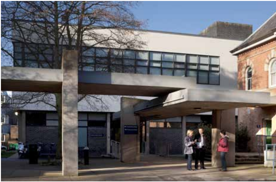
Figure 2: The University of Leicester School of Museum Studies in 2009