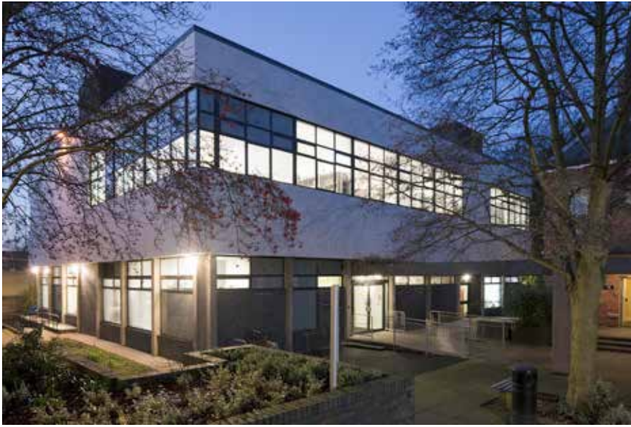
Figure 3: The University of Leicester School of Museum Studies in 2009.

During the 1966–67 academic year the department also hosted visiting lecturers who spoke on subjects including museum administration, museum security, types of museums, purposes of museums, and archaeological research.