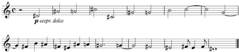
Ex. 3 French horn melody in sixth statement.

The seventh statement introduces new material as well. At the focal core the piccolo plays an ornamental melody consisting mainly of turns or gruppettos around the tonic, dominant, and occasionally subdominant notes of G sharp minor in fast quintuplets. Towards the end of the statement each last quintuplet becomes tied to the first of the next quintuplet group. As a consequence, the rhythm becomes vague and very much detached from that of the overall texture. Asynchronization is relocated from the layer level to that of rhythm, leading to further alienation between the layers. In the farther fringe, filling the register between the basses and the piccolo, the violins and violas play