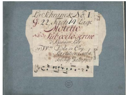
Ex. 4 Baldassare Galuppi. Motetti, Partiture sole: "Sub coelo sereno". Cover label (c.1784) hand of Carl Gottlob Uhle; D-DI, Mus. 2973-E-18. Original and reproduction:

All rights reserved © http://digital.slub-dresden.de/fileadmin/data/426200810/426200810_tif/jpegs/426200810.pdf