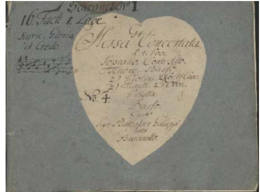
Ex. 2 Baldassare Galuppi. Messe: No. 4. Kyrie, Gloria e Credo. Storage (and incipit?) in hand of Schürer; Cover label: copyist S-DL-056 (RISM); "No: 4" hand of Uhle; D-DI, Mus. 2973-D-7. Original and reproduction: