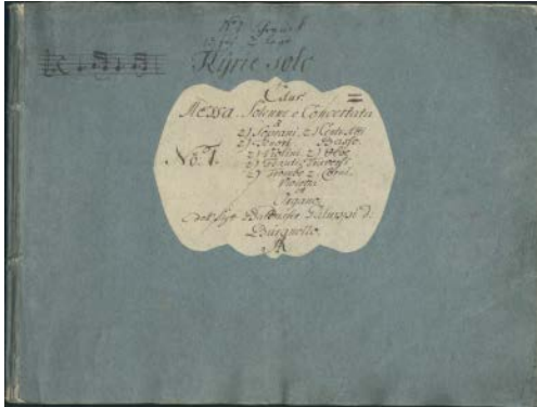
Ex. 1 Baldassare Galuppi. Messe: No. 1. Kyrie, Gloria e Credo. Storage in hand of Schürer; Incipit in hand of Uhle; Cover label (vol. 1): copyist S-DL-056 (RISM); "No: 1" hand of Uhle; D-DI, Mus. 2973-D-3. Original and reproduction: