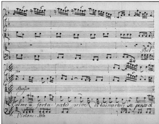
Figs. 3 and 4

The beginning of Bernasconi's aria Bell'alme fortunate from the Attems collection (SI-Mpa, no. 38, with kind permission) and the third page of the same aria from Flavio Anicio Olibrio (A-Wn, Musiksammlung; Mus.Hs. 18294/2, with kind permission)