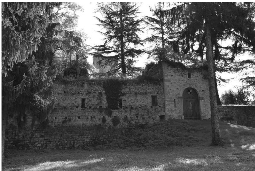
Fig. 5: The walls of the castle of Collalto today.