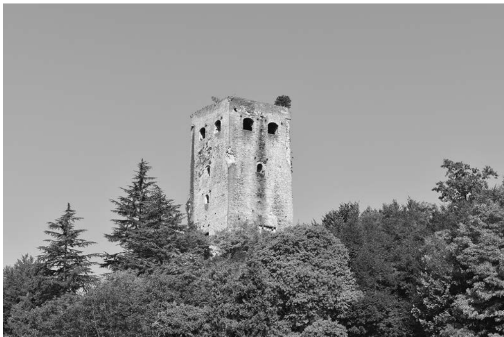
Fig. 4: The "big tower" of the castle of Collalto today.