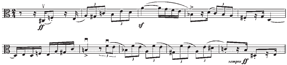
(4) The fugue subject, Vina , Act 2, mm. 1499–1508.

One of the most fascinating aspects of this fugue is that it continues to a formal conclusion despite two successive interruptions, first by Paní Mařáková, who comes in to ask about the laundry, and secondly by Uhlří, whom Mína manages to hold at bay until the letter (and the fugue) are complete. This very continuity is testament to the power that the unspoken idea – represented by the musical idea – has over Mína. Significantly, she never gets to deliver the letter, for the secret is revealed to Hošek and the relationship is irrevocably broken just moments later.