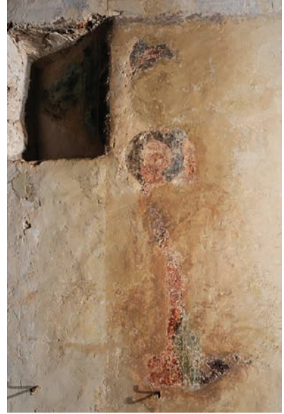
12. Procession of the elect. painted on the northern wall of the Trakai church, ca. 1419. Photo: Kęstutis Stoškus, 2008.