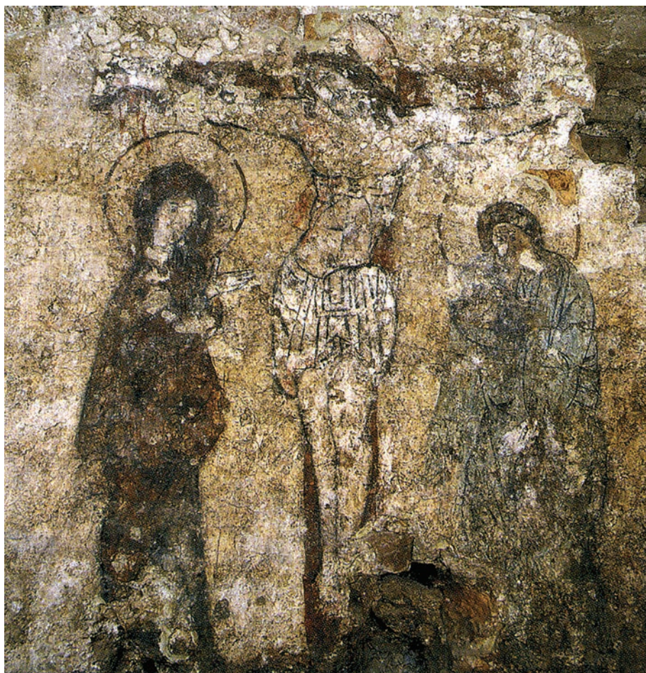
20. Crucifixion with the Virgin Mary and St. John the Evangelist, wall painting, Vilnius Cathedral, ca. 1400.