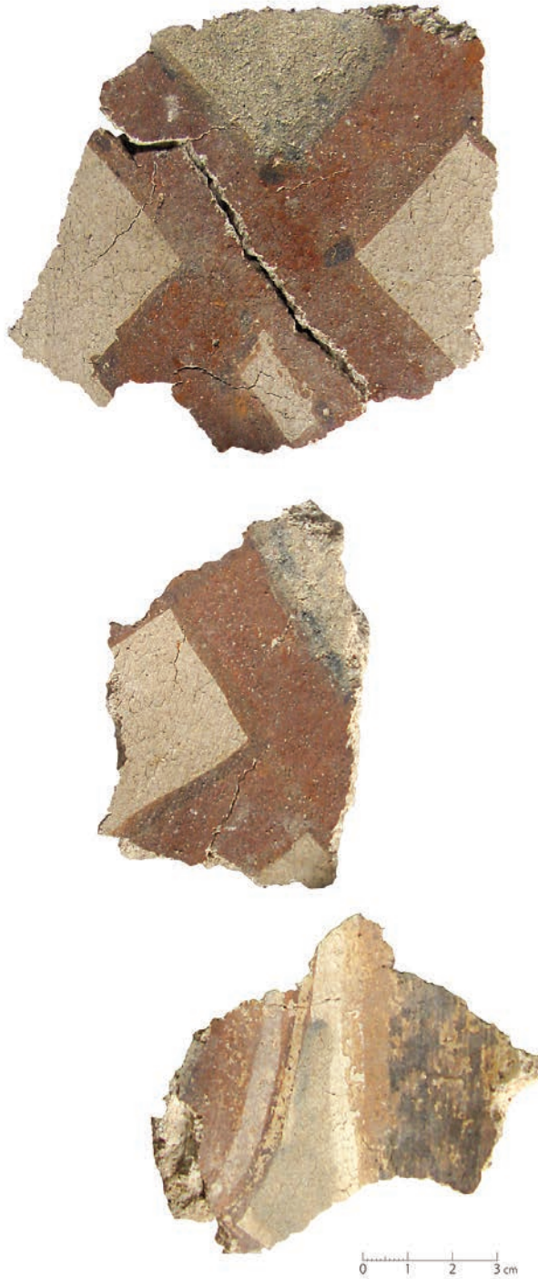
2. Kreva: fragments with painted plaited ornaments excavated in 1988.