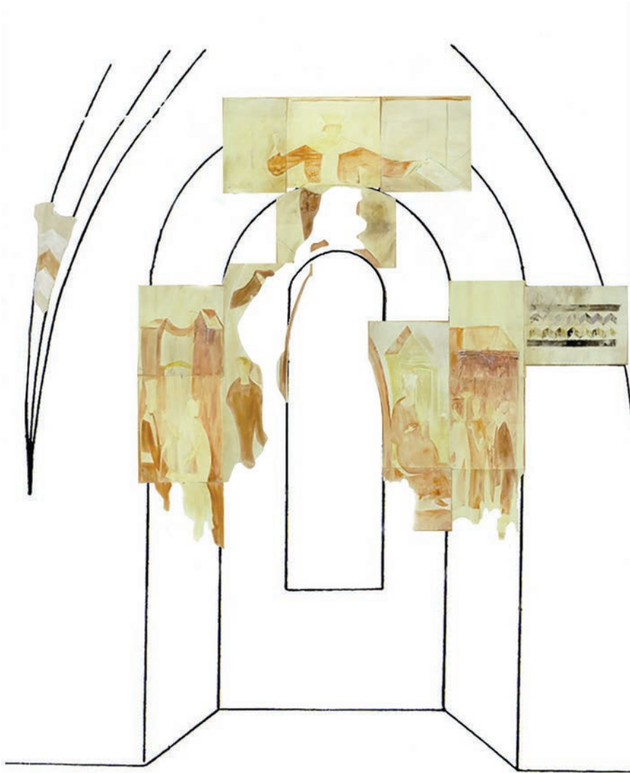
17. Jerzy Hoppen, Wall paintings in the palace of Trakai Island Castle, central niche of the audience hall (water colour on paper), 1932. Photo: Virginijus Usinavičius and Zenonas Nekrošius, 1997; arrangement: Giedrė Mickūnaitė, Lithuanian State Historical Archives, F. 1135, B. 12.