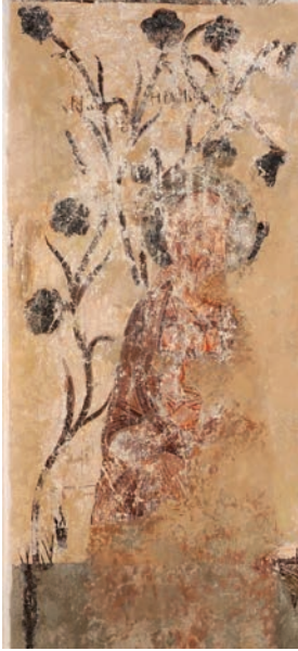
10. Patriarch Jacob under a tree of paradise painted on the western wall of the Trakai church, ca. 1419.