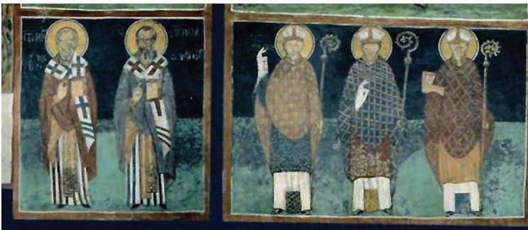
9. Sts Nicolas and Basil the Great and three saint bishops in Catholic vestments, wall paintings on the southern wall of the apse of the Cathedral of Sandomierz, 1402–1416. After Bazylika Katedralna pw. Narodzenia Najświętszej Maryi Panny , p. 83.