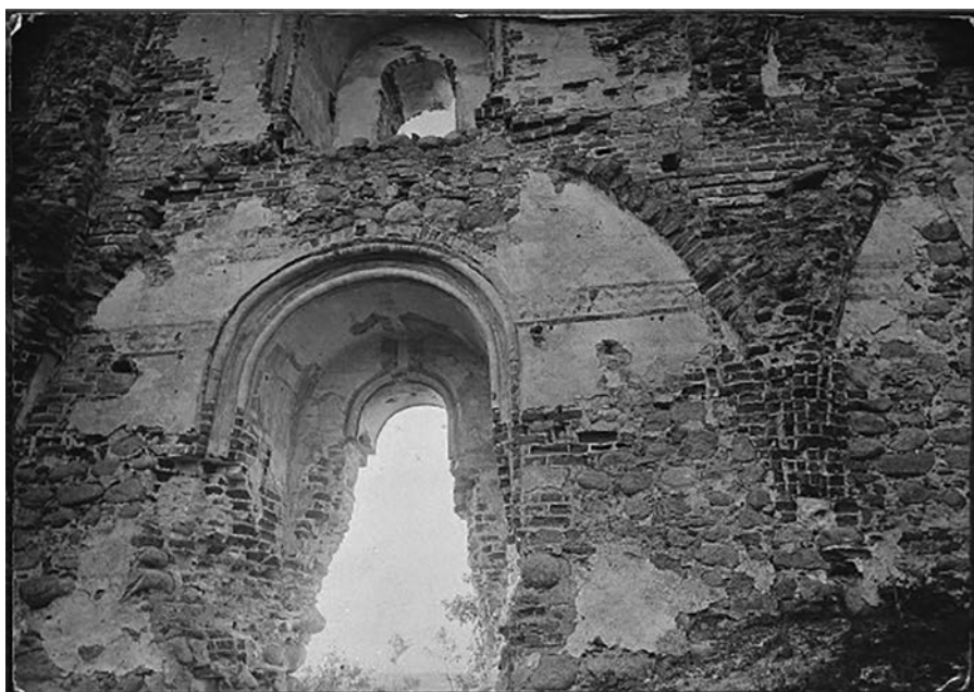
16. Stanisław Filibert Fleury, Wall paintings in the audience hall of the palace of the Trakai Island Castle, 1888. Institute of Art of the Polish Academy of Sciences, neg. no. 142764.