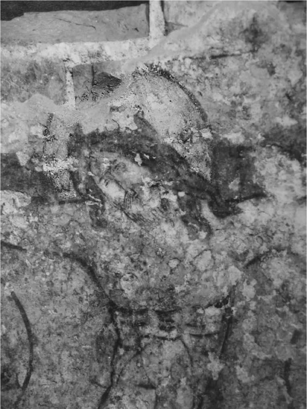
21. Figure with the Crucified, fragment of the composition 'Crucifixion with the Virgin Mary and St. John the Evangelist', Vilnius Cathedral, ca. 1400. Photo: Romualdas Sabataitis, 1985. Characters 'ω' and 'η' overdrawn by Giedrė Mickūnaitė.