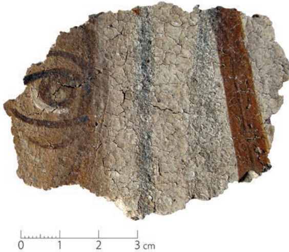
4. Kreva: fragment with remnant of face excavated in 2012.