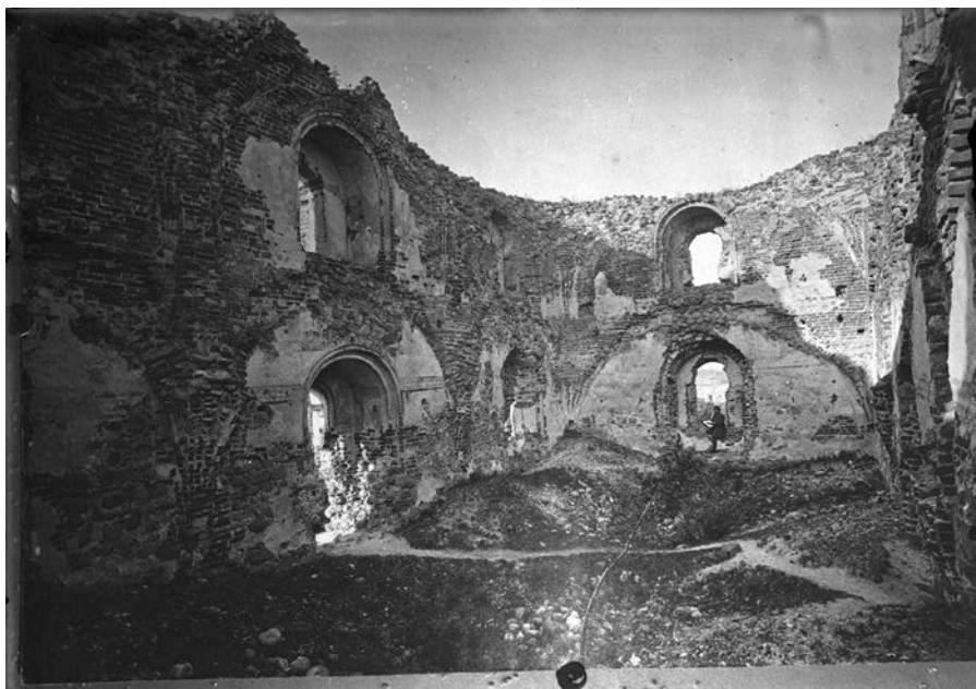
15. Southern wing of the palace of Trakai Island Castle, 1893. neg. no. 3213.