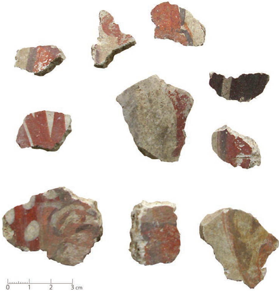
6. Medininkai: fragment with painted ornaments excavated in 1994. Photo: Giedrė Mickūnaitė, 2014.