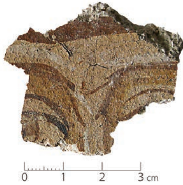
3. Kreva: fragment with remnant of face excavated in 2012. Photo: Giedrė Mickūnaitė, 2014.