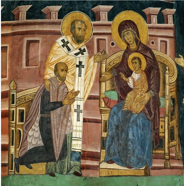
19. Master Andrew and assistants, Wladislas II Jogaila kneeling before the Virgin and Child, wall painting in the Chapel of Holy Trinity in Lublin castle, 1418. Available at: http://teatrnn.pl/leksykon/artykuly/freski-w-kaplicy-trojcy-swietej/#malowidla