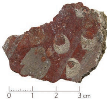
5. Medininkai: fragment with painted ornament finished with thick dots of white paint excavated 1994. Photo: Giedrė Mickūnaitė, 2014.