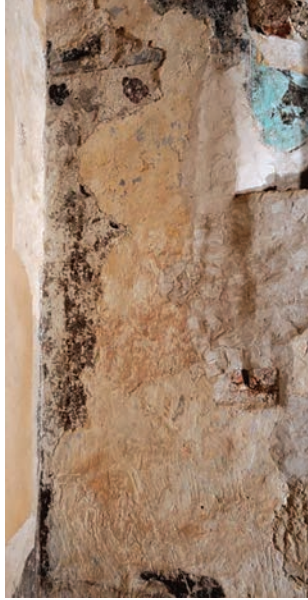
11. A tree of paradise painted on the northern wall of the Trakai church, ca. 1419. Photo: Kęstutis Stoškus, 2008.