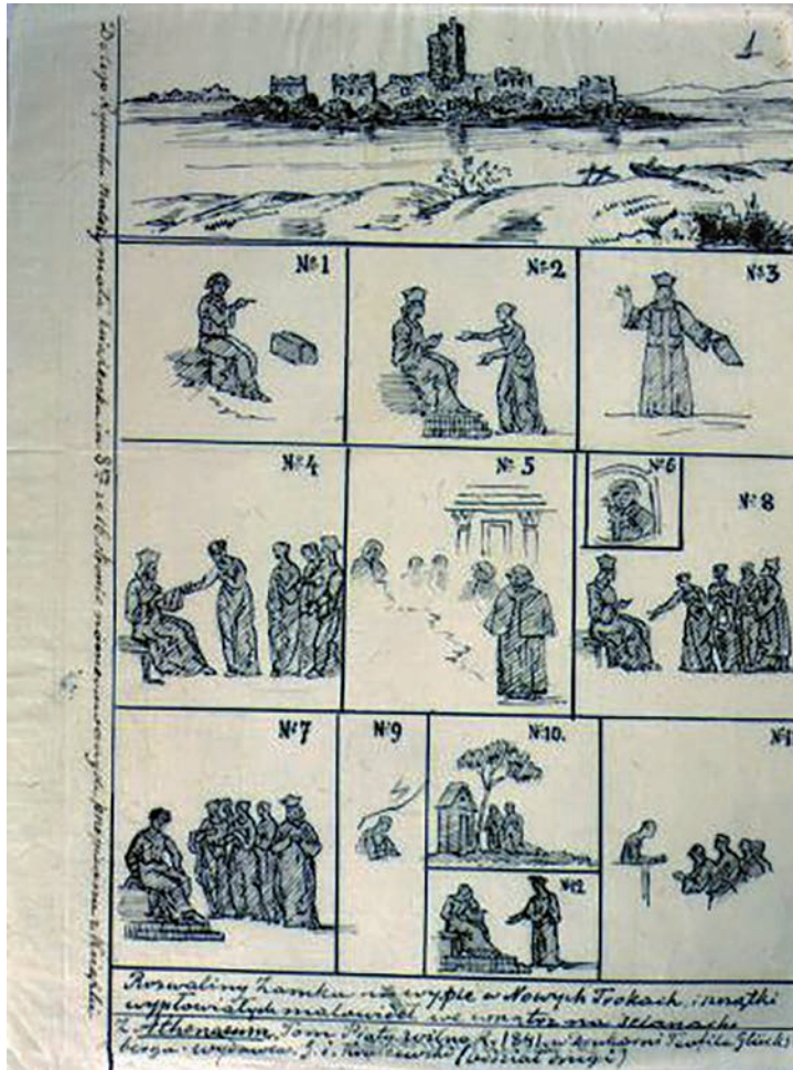
14. Wincenty Smokowski, Fragments of wall paintings in the palace of the Trakai Island Castle. Project of the lithograph, Indian ink on paper, 1841. Lithuanian State Historical Archives, F. 1135, B. 19, s.v. 74, fol. 1.