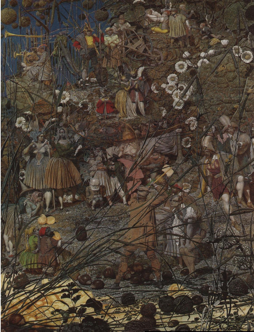
Figure 1: Richard Dadd: The Fairy Feller's Master-Stroke.

song that Clerc mentions (72) is thus, in fact, largely Dadd's. It is, however, interesting to observe how Mercury, in order to make Dadd's words fit the musical piece, plays with the Shakespearean landscape.