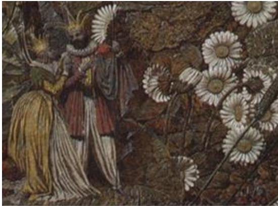
Figure 2: Oberon and Titania.

While the number of characters from the picture needed to be reduced for the purposes of a rock song (which is two minutes and forty-one seconds long), all the main Shakespearean elements remain. Queen Mab, the central character of the image's story, is mentioned only in passing: from the song, we never explicitly learn that