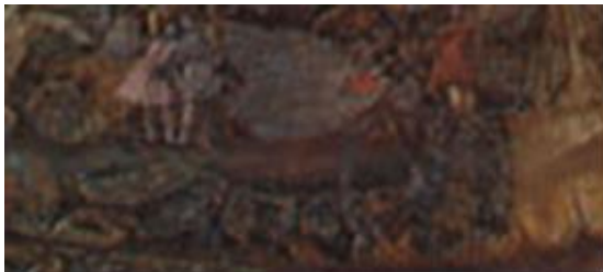
Figure 3: Queen Mab's chariot.

the fairy feller is going to crack the nut to make the Queen a new chariot (which Dadd explicitly mentions in his Elimination ); however, while Dadd mentions "King Oberon & his Queen" among the observers (20), 2 Mercury identifies Titania by her name, as known from Shakespeare's play. It is also noteworthy that the following line of the lyrics, "Mab is the queen and there's a good apothecary-man," links the apothecary with other well-known Shakespearean characters, while in Dadd's poem, apothecary is just one of a group of gathered characters from another part of the painting named by their professions: "soldier and sailor, tinker or tailor / Ploughboy, apothecary, thief" (21). The epithet "good," furthermore, might associate