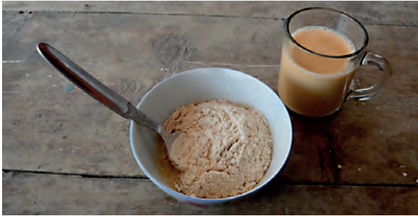
Fig. 1. Tibetan tsampa ready to be mixed with tea, Lower Mustang, Nepal 16

Consequently, we searched for a particular food which was fundamental or inevitable for all missionaries but, at the same time, largely alien to Tibetan food culture. This requirement led us quite directly to bread as a staple food of the Bible and a key concept in Christianity but somewhat unlike the omnipresent Tibetan tsampa ( ritsam pa ) – a roasted barley flour, which was and still is the Tibetan staple food and also the key ritual food-stuff (Fig. 1). And since Moravian missionaries, as the principal translators of the Tibetan Bible, were so dutiful in their work, an intriguing topic immediately manifested itself. Thus, and therefore, this paper deals with the question of how these early translators (and their successors) approached the concept of bread and its transfer into Tibetan culture, thereby asking why tsampa was not considered as a suitable local equivalent. And, by extension, is it even possible to think of tsampa as such a parallel for the Biblical bread – either as a staple food (i.e., the daily bread or food in the Lord's Prayer) or as a sacrament (i.e., the bread or Eucharist in the Last Supper)?