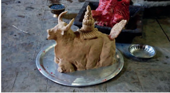
Fig. 3. Tsampa used for effigies in an annual ritual in Lubra village, Mustang, Nepal 53

However, it is tsampa which is often being regarded as the Tibetan identity marker per se – both in Tibetan and Western discourses. 54 As early as in the 18 th century, Ippolito Desideri remarked: “They do not eat wheaten bread, but zamba [= tsampa], which is the flour of ground parched barley mixed with a little water, generally hot, into very small balls which they eat with their meat.” 55 Similarly, when Berthold Laufer questioned Odorico de Pordenone’s presence in Tibet, he did so by confronting Odorico’s notes on the abundance of bread and wine in Tibet with his own experience: