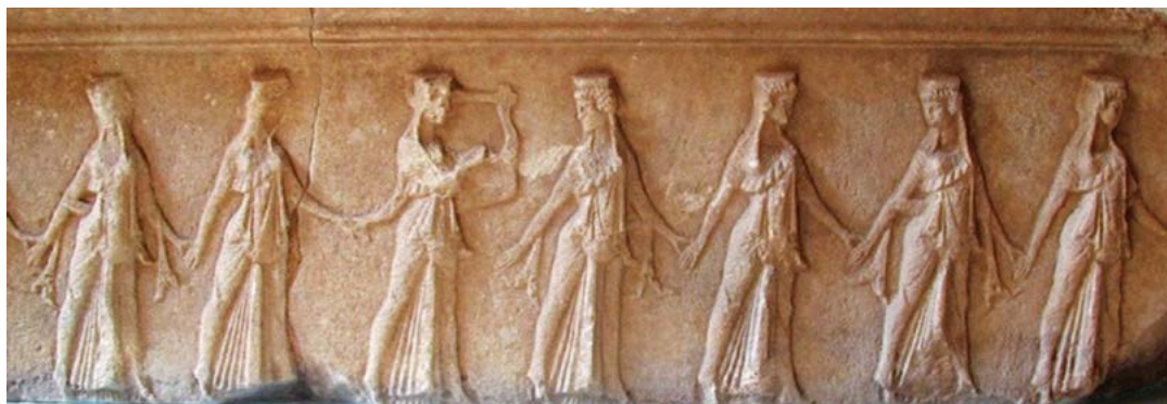
Fig. 8. The Samothrace frieze, Inv. No. 2455, Louvre. A relief depicting a row of dancing maidens

Obr. 8. Samotrácký reliéf, Inv. č. 2455, Louvre. Reliéf zobrazující řadu tancujících dívek