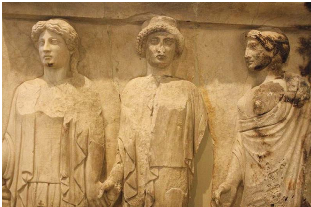
Fig. 4. The three Graces of Socrates, Inv. No. 2043, Piraeus Museum. A relief of Three Graces, the upper part is preserved

Obr. 4. Tři Grácie Sókratovy, inv. č. 2043, muzeum v Pireu. Reliéf Tří Grácií, zachována je vrchní část