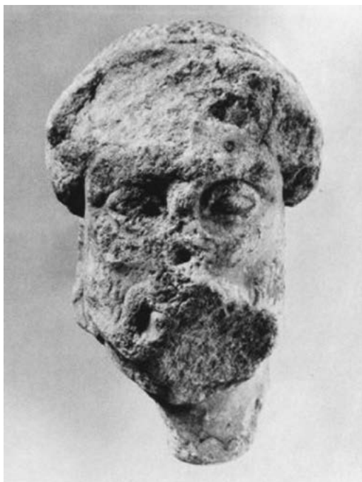
Fig. 1. Head from a Herm, Inv. no. S 211, Agora museum of Athens. An Early Classical herm, battered on the face and beard (after Harrison 1965 )

Obr. 1. Hlava hermy, inv. č. S 211, muzeum na Agoře v Athénách. Herma z raně klasického období, poničená na tváři a vousích (podle Harrison 1965 )