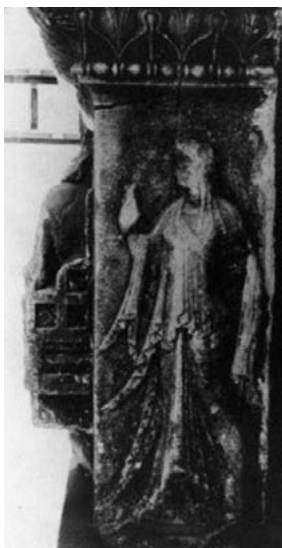
Fig. 6. Epidaurus Base relief, Inv. No. 1425, National Archaeological Museum of Athens An archaistic figure holding an oinochoe, probably Hebe (after Fiolitaki 2001 )

Obr. 6. Reliéf z Epidauru, inv. č. 1425, Národní archeologické muzeum v Aténách. Archaizující postava držící oinochoé, pravděpodobně se jedná o Hébé (podle Fiolitaki 2001 )