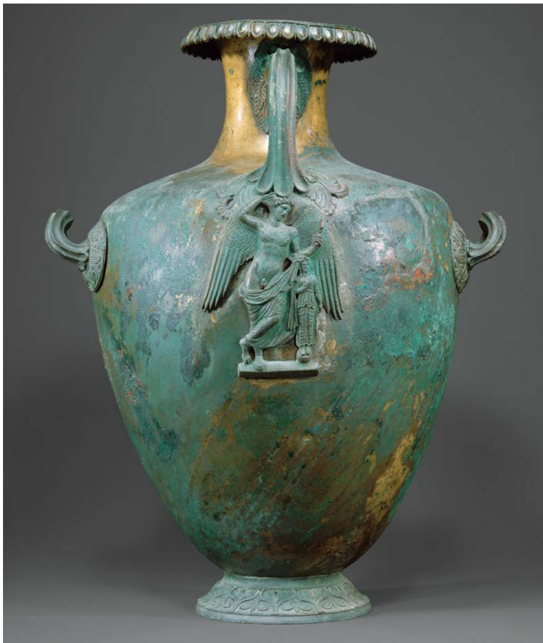
Fig. 9. Bronze Hydria, Inv. No. 44.11.9, Metropolitan Museum. A bronze hydria depicting Eros leaning on a kore statue (after https://www.metmuseum.org/art/collection/search/254515?searchField=All&sortBy=Relevance&where=Greece&what=Bronze%7cHydriae&ft=hydria&offset=0&rpp=20&pos=9 )

Obr. 9. Bronzová hydrie, inv. č. 44.11.9, Metropolitní muzeum. Bronzová hydrie s motivem Eróta opírajícího se o sochu koré (podle https://www.metmuseum.org/art/collection/search/254515?searchField=All&sortBy=Relevance&where=Greece&what=Bronze%7cHydriae&ft=hydria&offset=0&rpp=20&pos=9 )