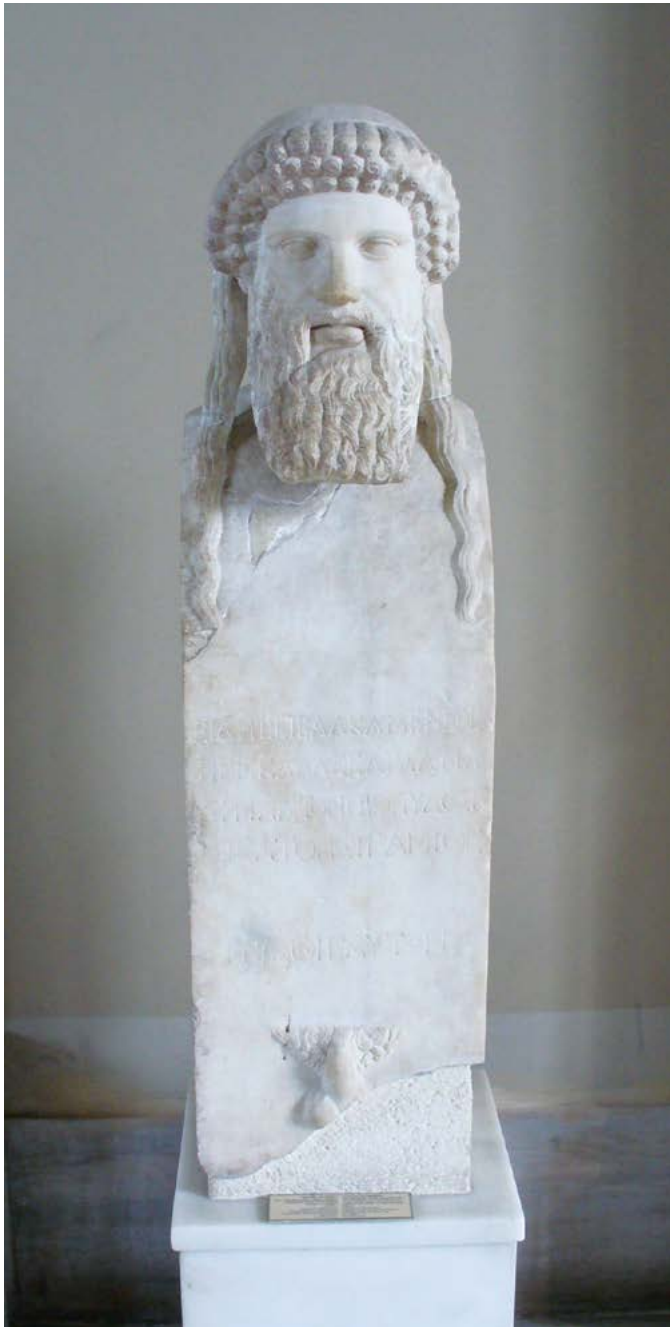
Fig. 3. Herm from Pergamon, Inv. No. 1333, Istanbul museum. A herm with an inscription on the base. The Pergamon copy (after https://commons.wikimedia.org/w/index.php?curid=2405348 )

Obr. 3. Herma z Pergamu, inv. č. 1333, muzeum v Istanbulu. Herma s nápisem na podstavci. Pergamonská kopie (podle https://commons.wikimedia.org/w/index.php?curid=2405348 )