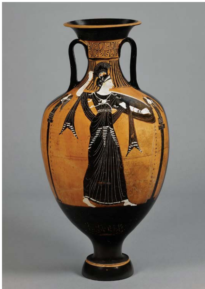
Fig. 7. Panathenaic Amphora, Inv. No. B 610, British Museum. Athena facing left, between two columns with statues (after https://www.britishmuseum.org/collection/object/G_1873-0820-370 )

Obr. 7. Panathenajská amfora, inv. č. B 610, Britské muzeum. Aténa je obrácena doleva a stojí mezi dvěma sloupy se sochami (podle https://www.britishmuseum.org/collection/object/G_1873-0820-370 )