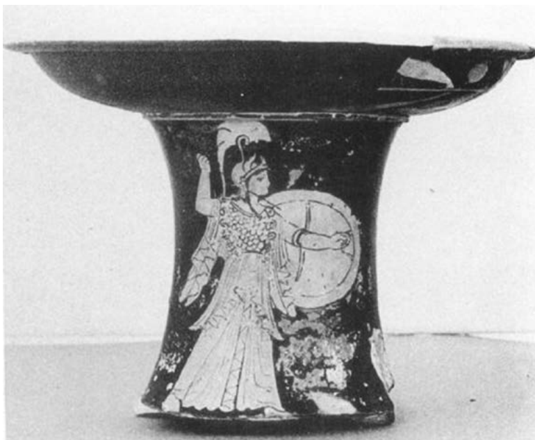
Fig. 5. Neck of red-figure oinochoe, Inv. No. 14793, The Agora Museum of Athens. Archaistic depiction of advancing and striding Athena (after Harrison 1965)

Obr. 5. Hrdlo červenofigurové oinochoé, inv. č. 14793, muzeum na Agoře v Athénách. Archaizující zobrazení kráčející Atény (podle Harrison 1965)