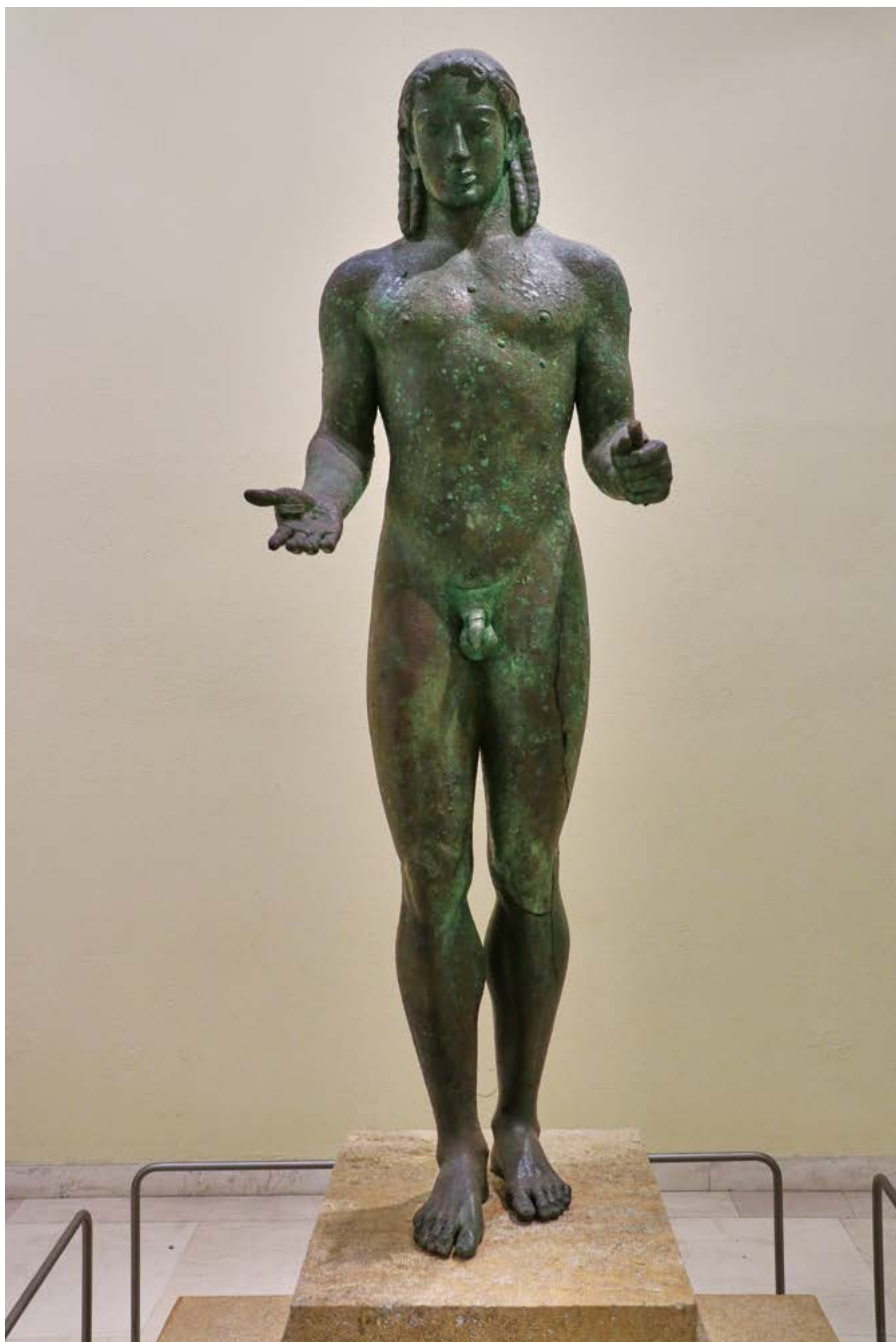
Fig. 10. Piraeus kouros, Inv. No. 4645, Piraeus Museum. An archaistic bronze kouros advancing on right leg (after https://commons.wikimedia.org/w/index.php?curid=71024254 )