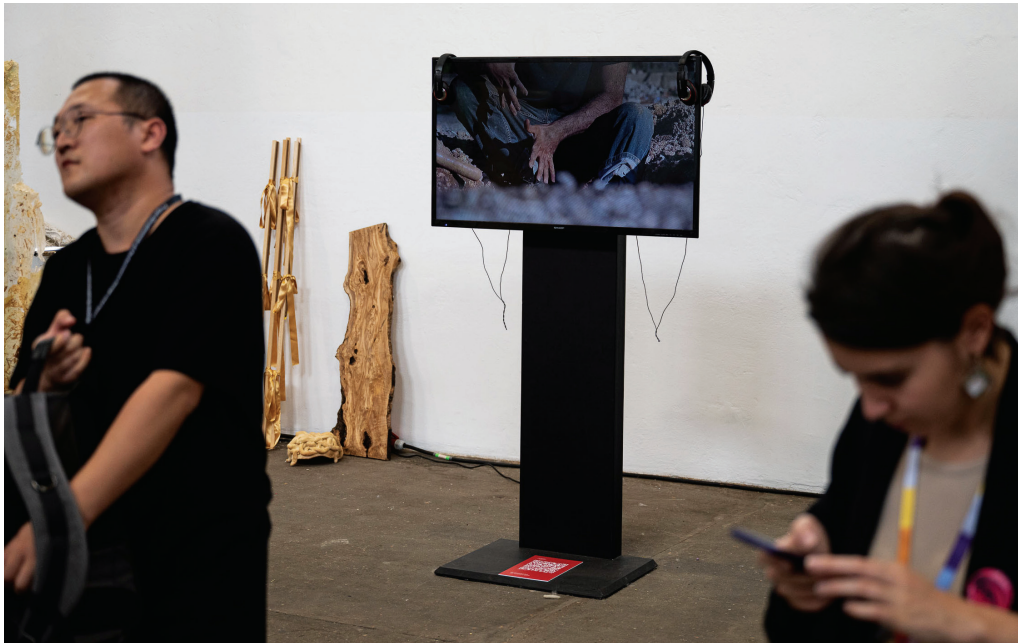
Fig. 2: A Breath into a Hole – ECR Lebanon. PQ 2023.