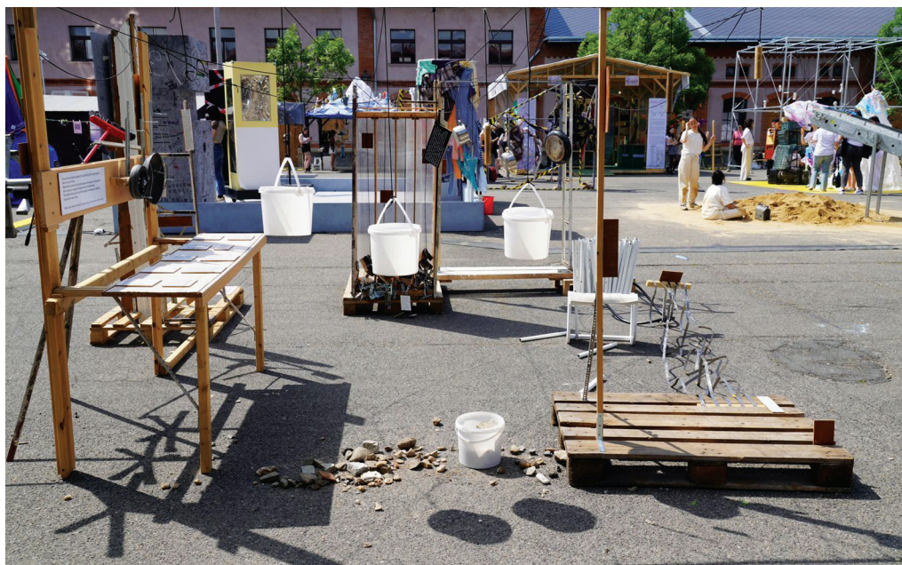
Fig. 5: Puzzles – SE Lebanon. PQ 2023.