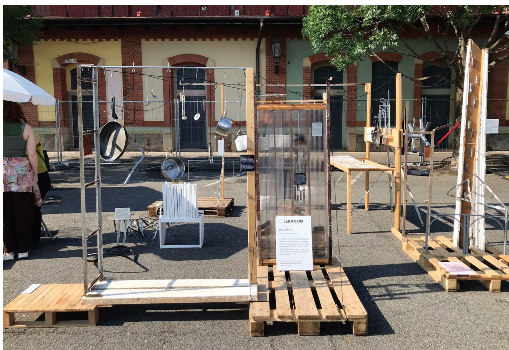
Fig. 4: Puzzles – SE Lebanon. PQ 2023.